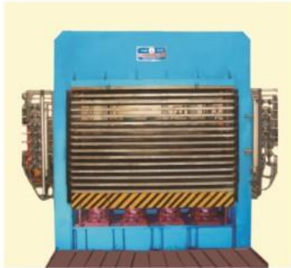
MULTI-DAYLIGHT HOT PRESS

These multilayer Hot presses are ideal for making Plywood, Bamboo Board, Particle Board and other composite boards. The structure is fabricated of Steel plates as per the pressure capacity. High pressure is achieved with Window-Frame type structure . Hot platens are made of solid MS plates with drilled holes for Steam / Thermic Oil Flow. This gives uniform temperature across the plates.