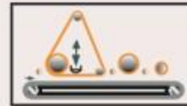
Model : BSE 1300 RP-M Brush