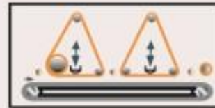
Model : BSE 1300 RP-P Brush