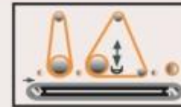
Model : BSE 1300 C-RP Brush