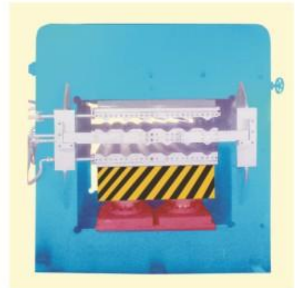
CORRUGATED HOT PRESS