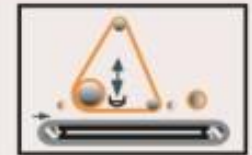
Model : BSE 1300 RP Brush