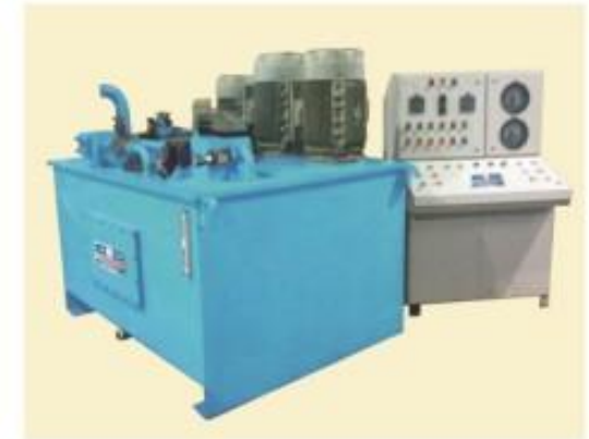
POWER PACK & PANEL